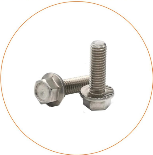
FLANGE BOLT (DIN/ISO/EN/JIS) SIZE: M6 TO M24 (Length to order) GRADE : 4.6, 8.8, 10.9 FINISHING: GALVANIZED