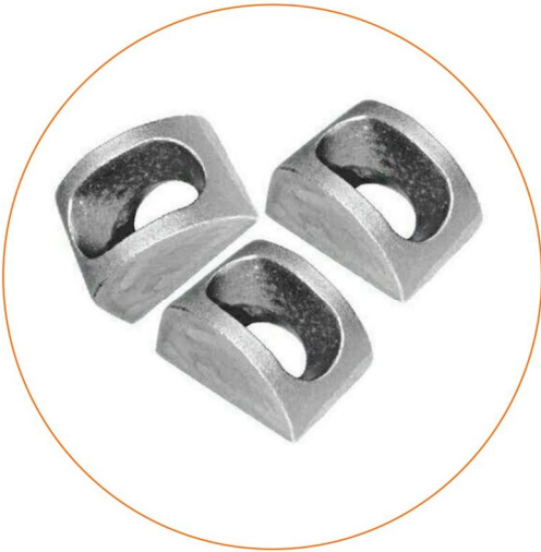
HILLSIDE WASHER SIZE: M12, M18, M20, M22, M27, M30, M32 MATERIAL : CI / SGI FINISHING: PLAIN/GALVANIZED