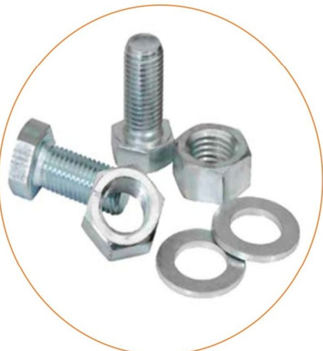
HEX BOLT, NUT, WASHER SIZE: M6 TO M16 (IS/DIN/BS) GRADE 4.6, 4.8, 5.6, 8.8, 10.9 FINISHING: ZP / BLACK