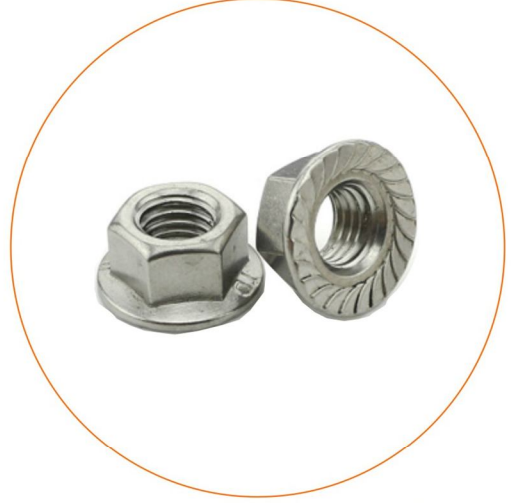
FLANGE NUT (DIN/ISO/EN/JIS) SIZE: M6 to M24 GRADE : 4.6, 8.8, 10.9 FINISHING: GALVANIZED