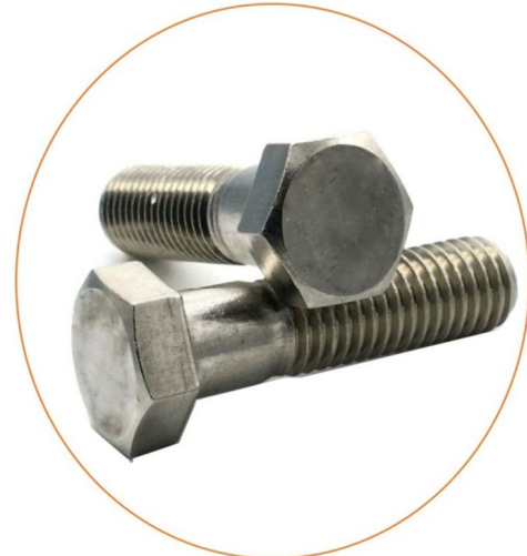
HEX BOLT (HALF THREAD) SIZE: M6 TO M42 (IS/DIN/ASTM) GRADE 4.6, 4.8, 8.8, 10.9, 12.9 FINISHING: ZP / BLACK