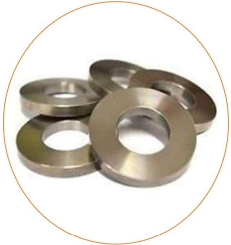
PLAIN WASHER (IS/DIN/ASTM) SIZE: M6 TO M42 GRADE 4.6, 8.8 FINISHING: ZP / BLACK