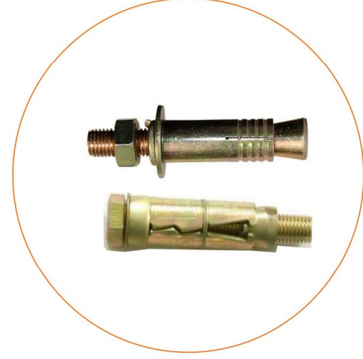
PROJECTION ANCHOR BOLT RAWAL ANCHOR BOLT SIZE: TO ORDER FINISHING: GALVANIZED