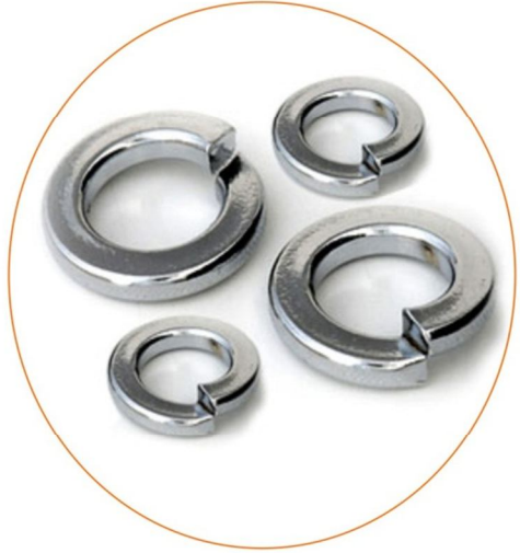
SPRING WASHER SIZE: M6 TO M36 (IS) MATERIAL: MS / EN42 FINISHING: ZP / BLACK