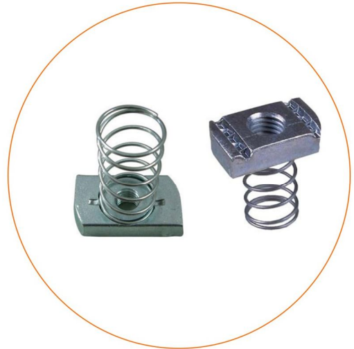
CHANNEL SPRING NUT SIZE: M6, M8, M10, M12 MATERIAL : MS/ SS FINISHING: GALVANIZED