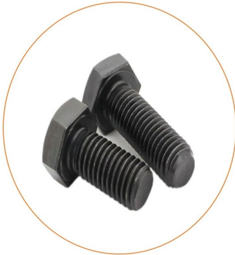
HEX BOLT (FULL THREAD) SIZE: M6 TO M42 (IS/DIN/ASTM) GRADE 4.6, 4.8, 8.8, 10.9, 12.9 FINISHING: ZP / BLACK