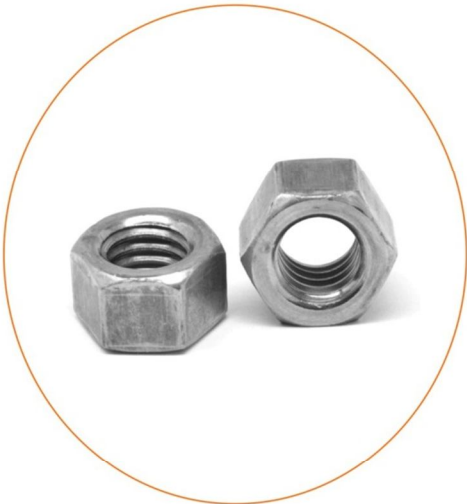
HEX NUT (IS/DIN/2H/10S/ASTM) SIZE: M6 TO M42 GRADE 4.6, 4.8, 8.8 FINISHING: ZP / BLACK